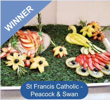
St Francis Catholic - Peacock & Swan