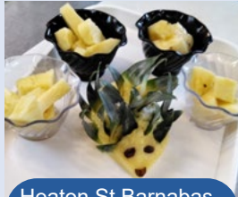
Heaton St Barnabas - Pineapple Hedgehog