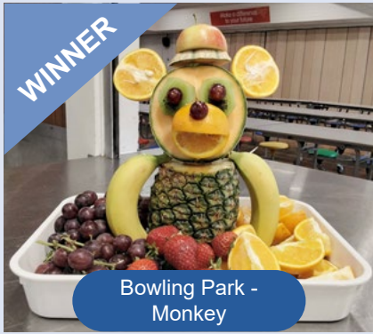
Bowling Park - Monkey