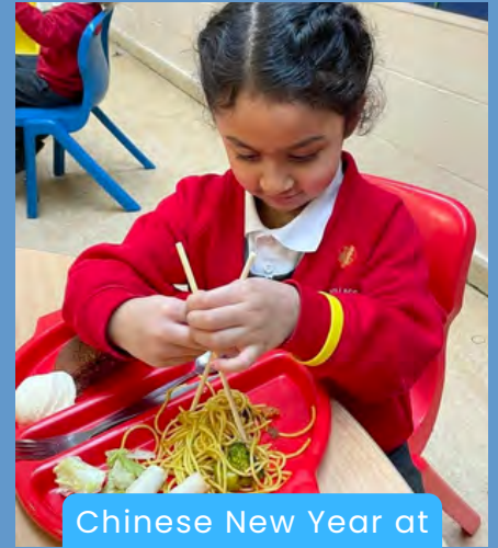
Chinese New Year at Cullingworth Village