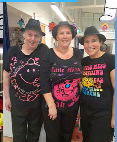
Chinese New Year, Valentines day and World Book day at Reeve Hill