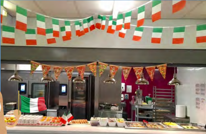
Census day (Italian) at Wibsey Primary