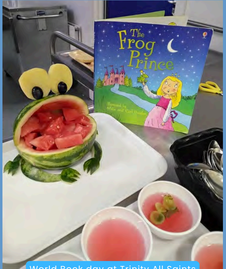
World Book day at Trinity All Saints