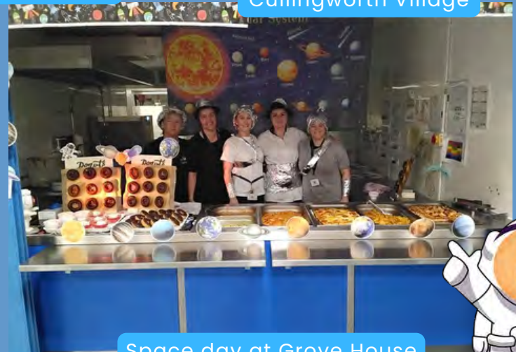
Space day at Grove House