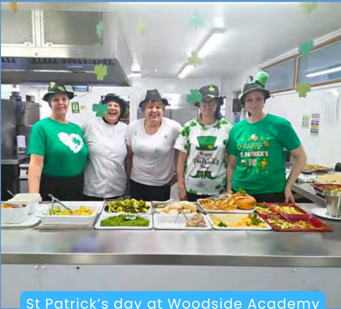
St Patrick's day at Woodside Academy