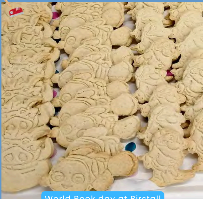
World Book day at Birstall