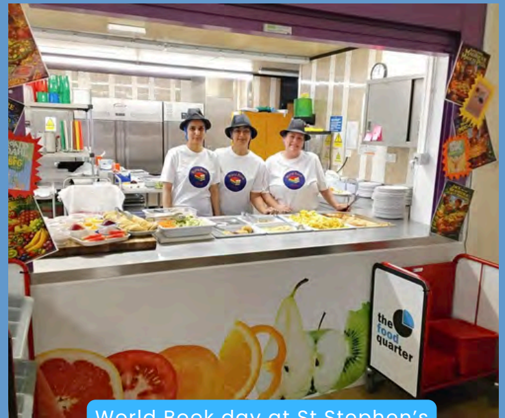
World Book day at St Stephen's