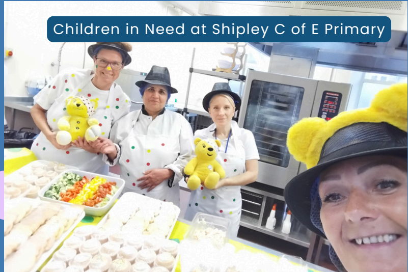
Children in Need at Shipley C of E Primary