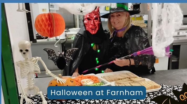
Halloween at Farnham