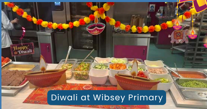
Diwali at Wibsey Primary