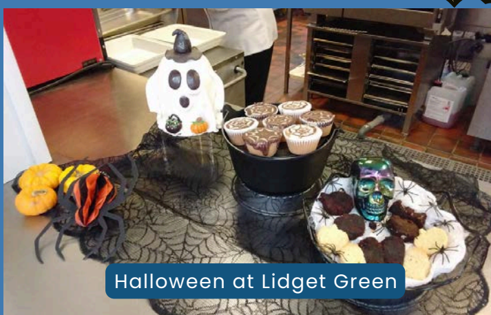
Halloween at Lidget Green

Please send any Christmas theme day photos to: