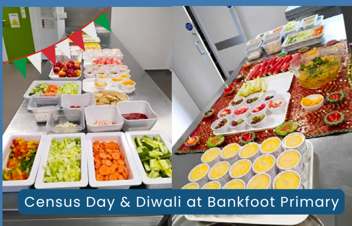
Census Day & Diwali at Bankfoot Primary