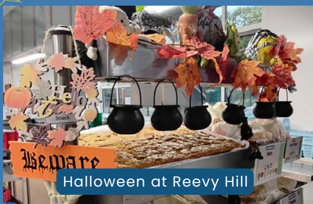
Halloween at Reevy Hill