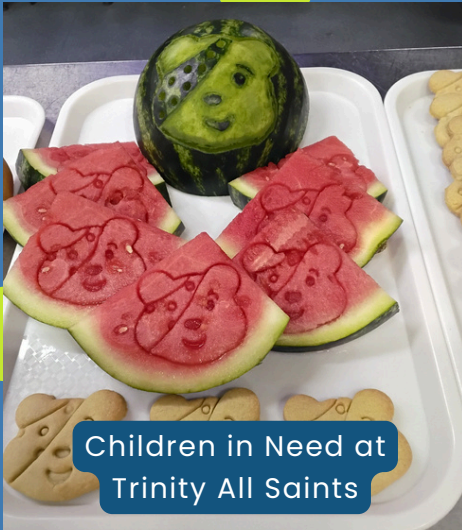
Children in Need at Trinity All Saints