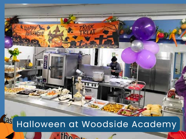
Halloween at Woodside Academy