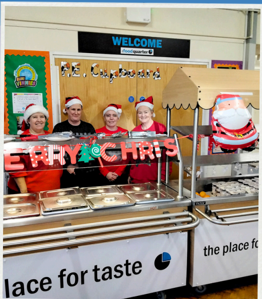
St Matthew's Catholic