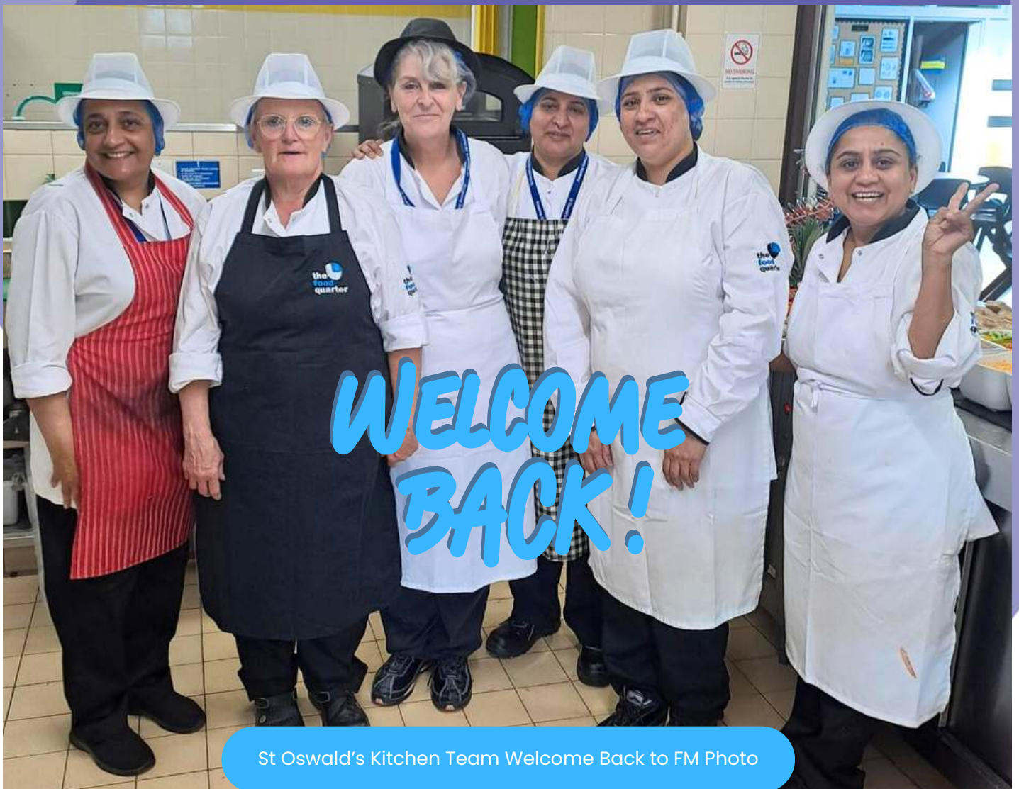
St Oswald's Kitchen Team Welcome Back to FM Photo