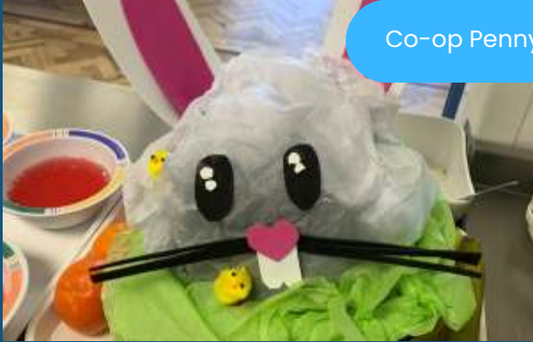
Co-op Penny Oaks - Easter 2024