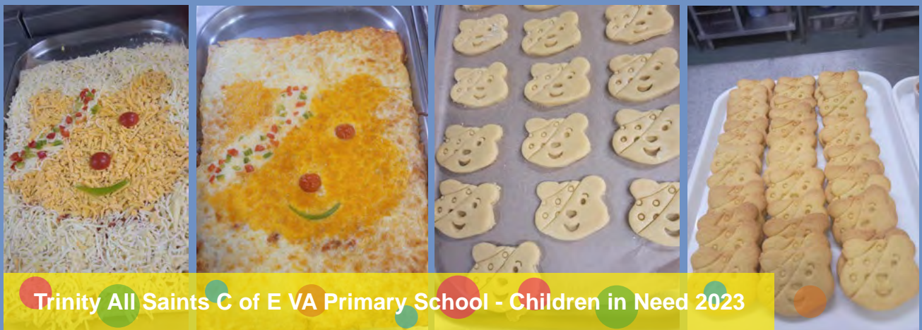
Trinity All Saints C of E VA Primary School - Children in Need 2023