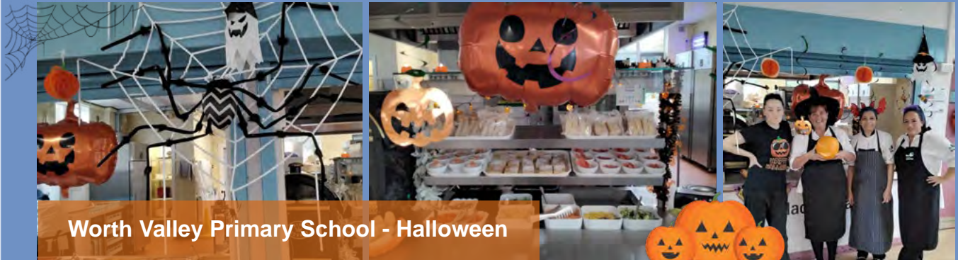
Worth Valley Primary School - Halloween