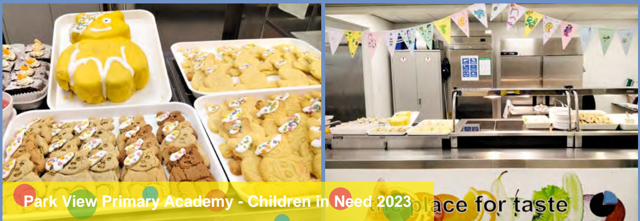
Park View Primary Academy - Children in Need 2023