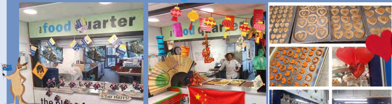
Beckfoot Nessfield Primary School & Nursery - Chinese New Year & Australia Day