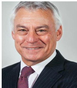
David Ward MP Bradford East