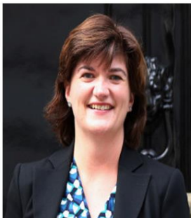
Rt Hon. Nicky Morgan MP Women & Equalities