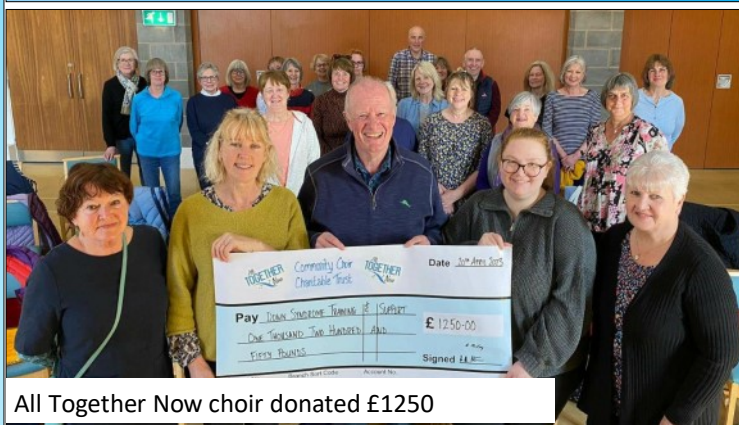
All Together Now choir donated £1250